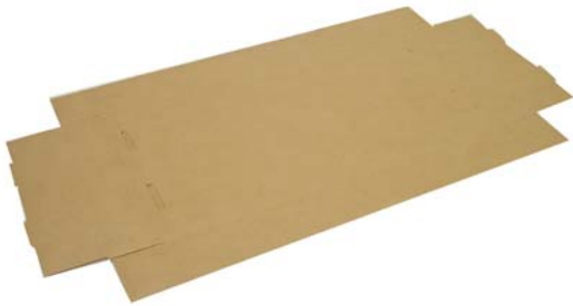
One (1) Lid

The Magazine Box or Comic Box consists of a total of two (2) pieces. You should have the following before you begin: